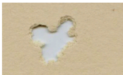
H&N Baracuda Match .177 Caliber